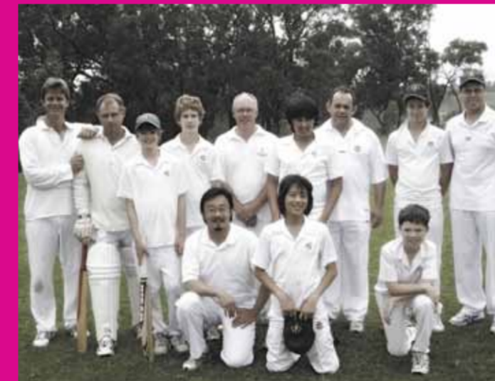
ELTHAM Collegian Cricket Club Father-Son-Grandfather Team